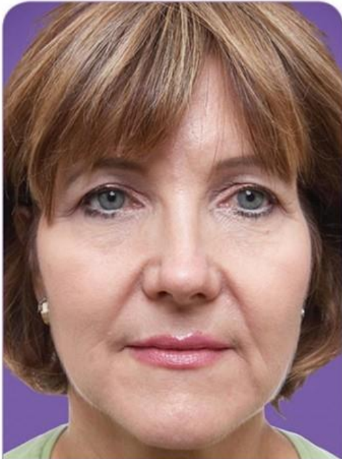
Before JUVÉDERM® treatment