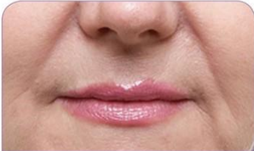
Before JUVÉDERM® treatment