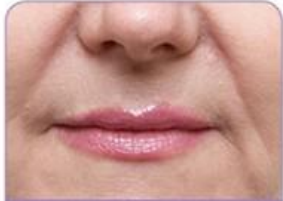
Before JUVÉDERM® treatment