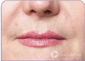
After 2 syringes JUVÉDERM® Ultra Plus (1.6 mL) (3 weeks after injection of second syringe)