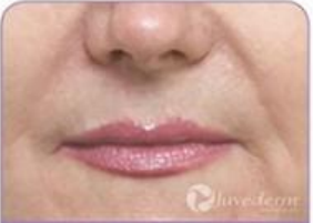
After 1 syringe JUVÉDERM® Ultra Plus (0.8 mL) (2 weeks after injection)