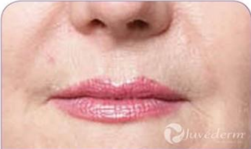
After 2 syringes JUVÉDERM® Ultra Plus (1.6 mL)