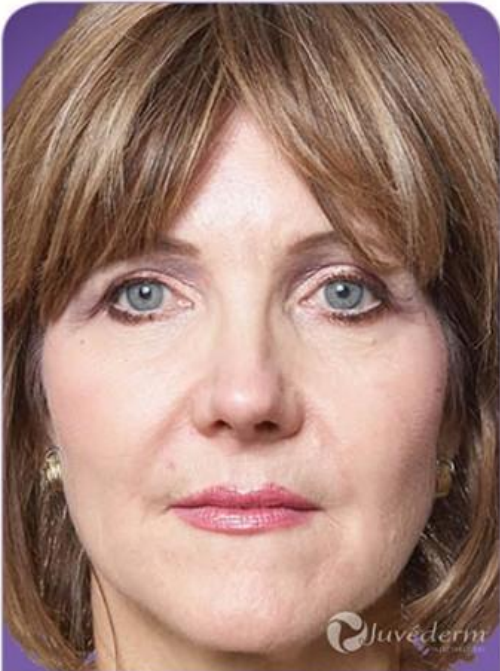
After 2 syringes JUVÉDERM® Ultra Plus (1.6 mL)